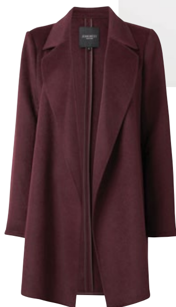
JEANSWEST ADELE WOOL-BLEND COAT $199.99