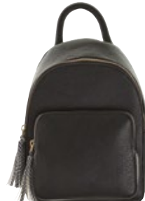
STRANDBAGS MARIKAI MINI BACKPACK $44.99