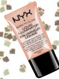
PRICELINE NYX BORN TO GLOW LIQUID ILLUMINATOR $14.95