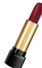
MYER LANCÔME L'ABSOLU ROUGE LIPSTICK $32