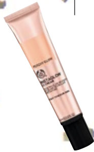
THE BODY SHOP INSTAGLOW PEACHY GLOW CC CREAM $27.95