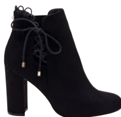
NOVO KASTELLI BOOT $89.95