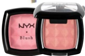
PRICELINE NYX POWDER BLUSH $9.95 EA