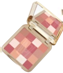
MYER NAPOLEON PERDIS MOSAIC BLUSHING POWDER $60