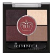
PRICELINE RIMMEL GLAM EYES HD 5-PAN EYESHADOW IN BRIXTON BROWN $15.95