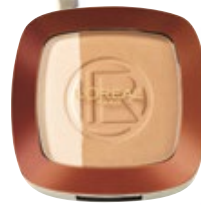
CHEMIST WAREHOUSE L'ORÉAL GLAM BRONZE DUO $29.45