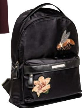
COLETTE BY COLETTE HAYMAN BUMBLEBEE BACKPACK $59.99