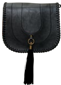
BEACHES APPAREL BILLABONG RYDER CARRY BAG $49.99