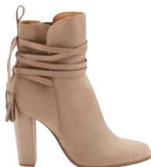
NOVO KAREN BOOT $89.95