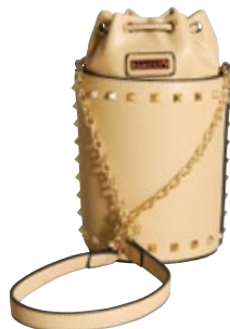
CFO AMEISE HANDBAG $79.99