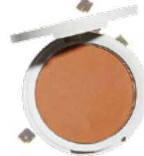
ENDOTA SPA MINERAL BRONZING POWDER $45