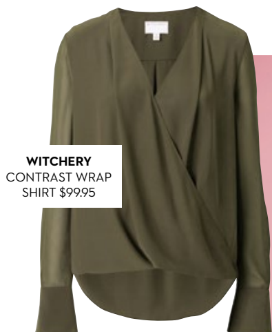
WITCHERY CONTRAST WRAP SHIRT $99.95