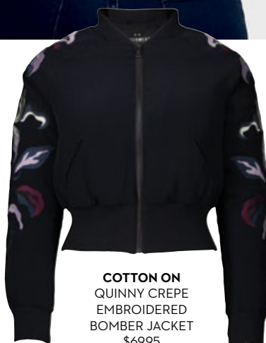
COTTON ON QUINNY CREPE EMBROIDERED BOMBER JACKET $69.95