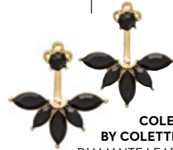
COLETTE BY COLETTE HAYMAN DIAMANTE LEAF FRONT BACK GOLD EARRINGS $9.99