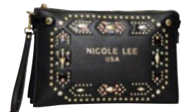
CFO NICOLE LEE STUD CLUTCH $129.99