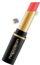
MYER NAPOLEON PERDIS AUTO PILOT TINTED LIP BALM IN TULIP $29