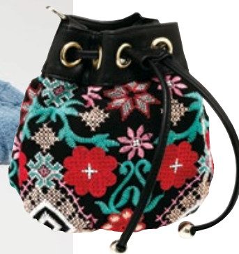
COLETTE BY COLETTE HAYMAN FOLK DRAWSTRING BAG $29.99