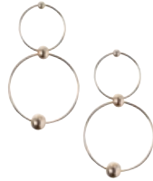
LOVISA GOLD DROP EARRINGS $10.99