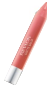
PRICELINE REVLON COLORBURST MATTE BALM IN MISCHIEVOUS $5