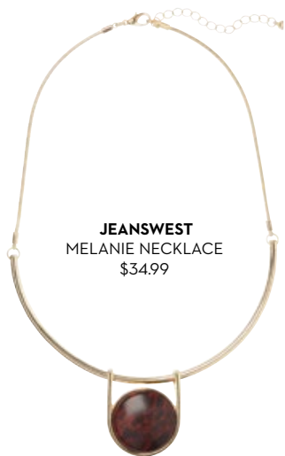
JEANSWEST MELANIE NECKLACE $34.99