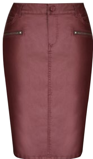
KATIES ZIP DETAIL COATED SKIRT $59.95