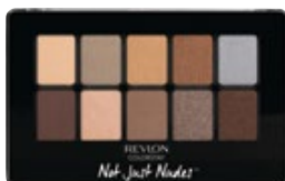
CHEMPLUS REVLON NOT JUST NUDES SHADOW PALETTE $29.95