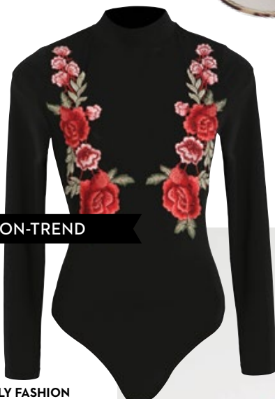
ALLY FASHION ROSE APPLIQUÉ LONG SLEEVE BODYSUIT $25.99