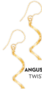
ANGUS AND COOTE GOLD TWIST DROP EARRINGS $139