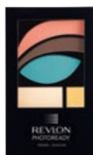
CHEMPLUS REVLON PHOTOREADY PRIMER + SHADOW $25.95