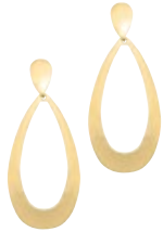
COLETTE BY COLETTE HAYMAN METAL OVAL DROP EARRINGS $12.99