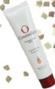
SILK LASER CLINICS O COSMETICS MINERAL PRO SPF 30+ $47