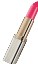
PRICELINE L'OREAL PARIS COLOUR RICHE LIPSTICK IN MISTINGUETTE $21.95