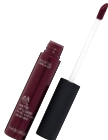
THE BODY SHOP MAURITIUS DAHLIA MATTE LIQUID LIP $14