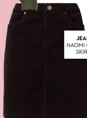
JEANSWEST NAOMI CORDUROY SKIRT $79.99