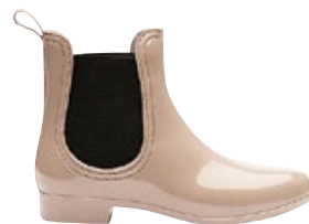
WITCHERY CHELSEA RAIN BOOT $69.95