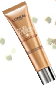
CHEMPLUS L'ORÉAL TRUE MATCH LIQUID ILLUMINATOR $24.95