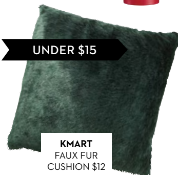
KMART FAUX FUR CUSHION $12