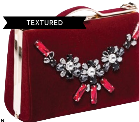
COLETTE BY COLETTE HAYMAN KATE JEWEL CLUTCH $49.99