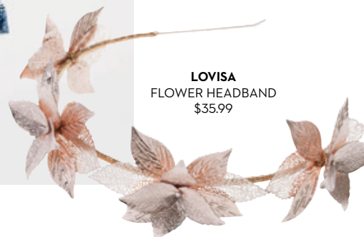
LOVISA FLOWER HEADBAND $35.99