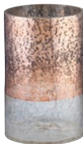
DUSK SHIMMER ROSE GOLD HURRICANE SMALL $29.99 LARGE $34.99