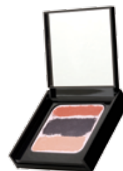
MYER NAPOLEON PERDIS TOTAL BAE MARK IT! EXPRESSION $39