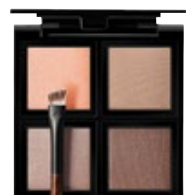
THE BODY SHOP DOWN TO EARTH BROWN QUAD $34.95