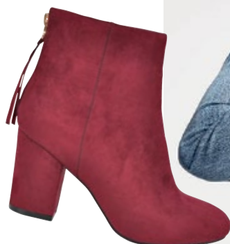
SPEND-LESS SHOES REQUEST BOOT $49.99